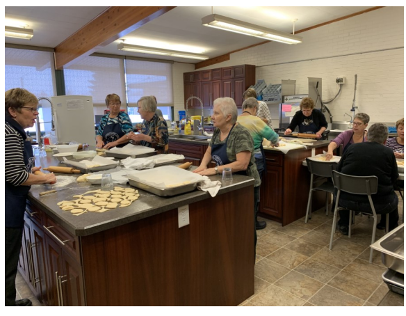
Making cabbage rolls and perogies Making Spring rolls